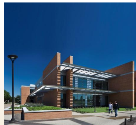
Sabine Hall, RLC