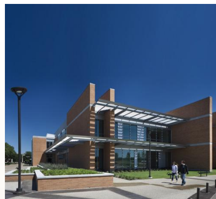
Sabine Hall, RLC